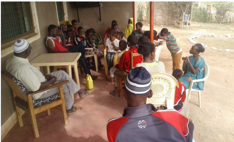
Counseling meeting for Obbitu children