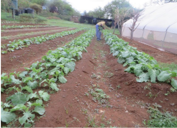
Sukuma-wiki in the open field