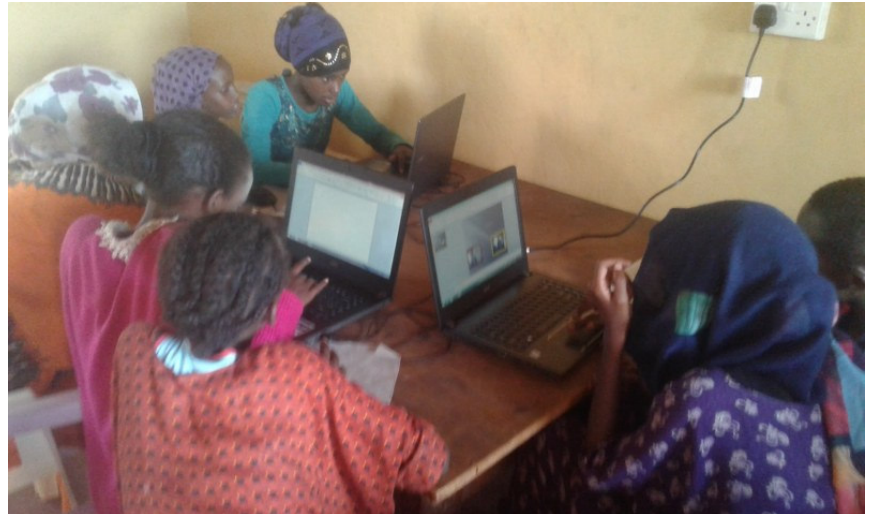
Computer training session