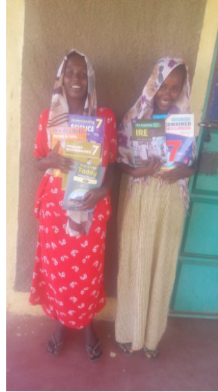
Textbooks distributed for Obbitu Children