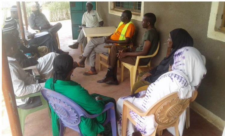
OVC MANAGMENT COMMITTEE MEETING