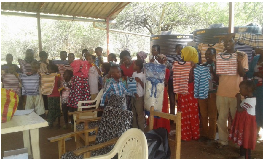
Meeting between CIPAD