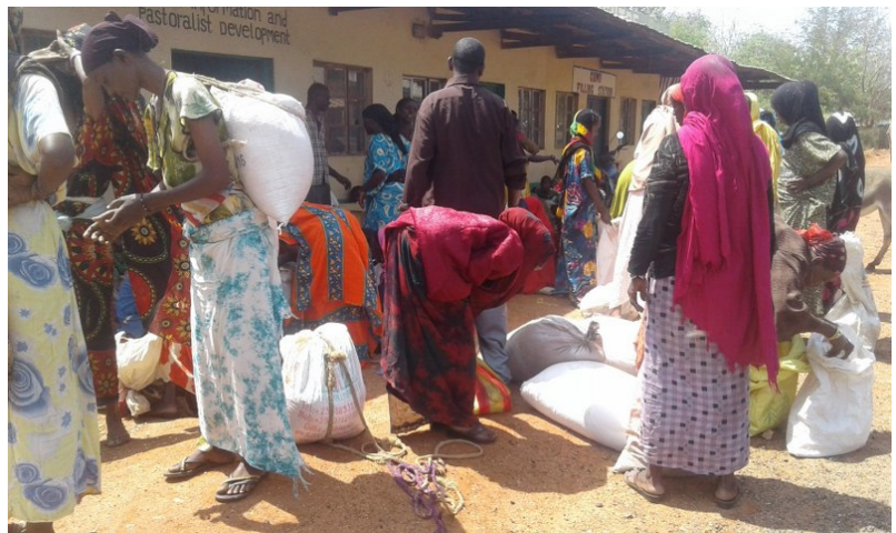
HBC Food 2 monthly ration