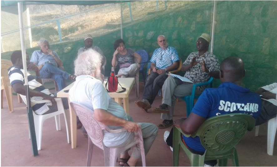
Kononians community and Mondeco president.