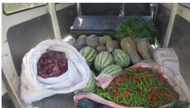
Oninos, pumpkins, water melons, and dania,pepper