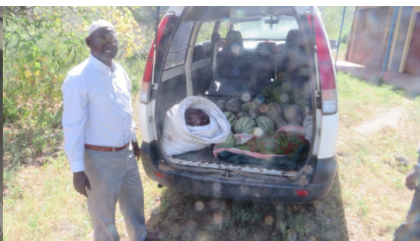
Transporting to the market

This was one of our pamper harvest in recent past; I had to borrow a car to take it to the market hospital and nearby school. The content included onions, water melons, pumpkins, danna for aromatic and long tail burner pepper. The harvest has been going down. But it has contributed to nutrition of Obbitu children. The tomatoes produce is minimal and was consumed at Obbitu children. Water level in the pans is little and might not take us up to end of February. Below is the quantity of harvest got from the green houses.