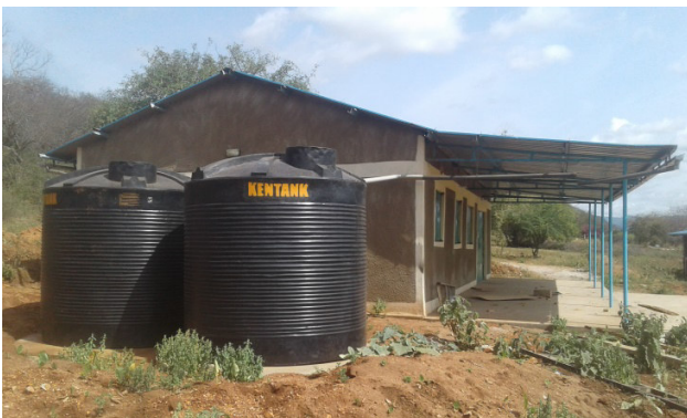
Water tanks installed at the workshop