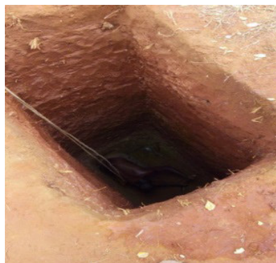
Toilet pit big dung 6,1m deep