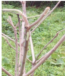
caterpillar ate the leaves