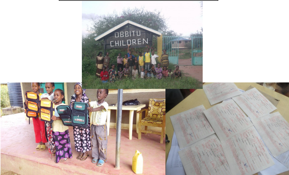
OVC SOLOLO PROJECT