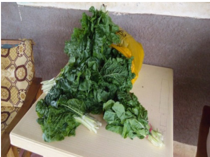
Spinach from greenhouse