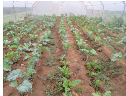
Sukuma wiki doing well