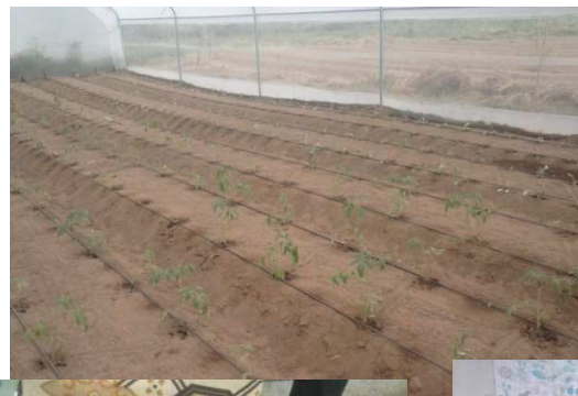
Greenhouse number 4