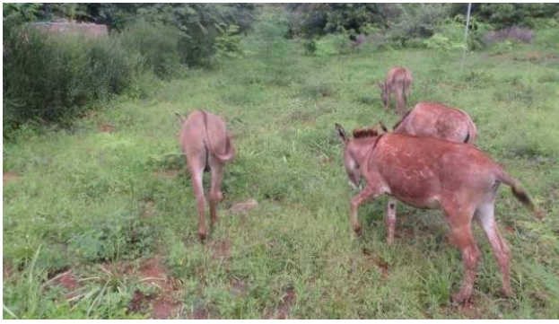
the four donkeys purchased for livelihood activities