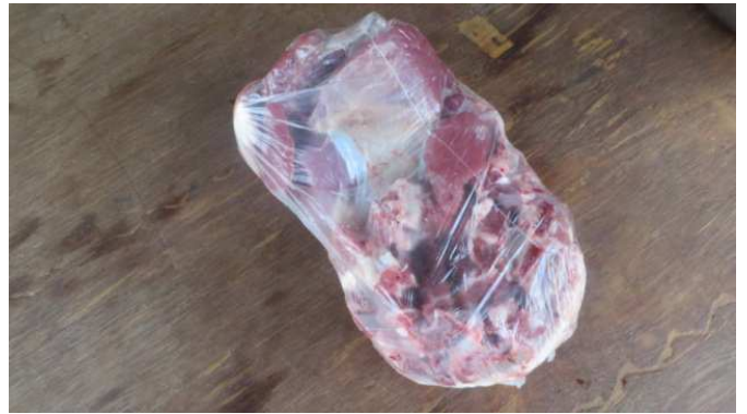
1kg of meat for 1 family