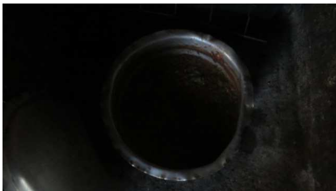
Beans stew with vegetables for lunch in Obbitu