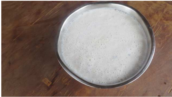
Milk for one family