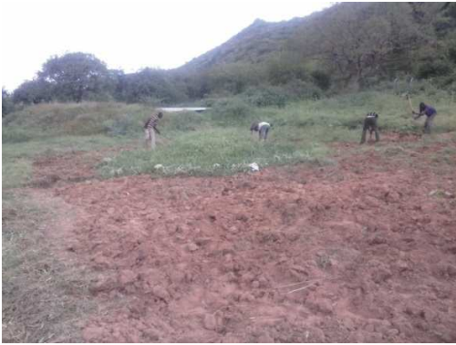
casual clearing weeds